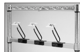
CATHETER SIDE BAR

ALL PRODUCTS FOB: LAS VEGAS PRODUCT CODE: O