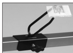
CATHETER HOOKS WITH LABEL HOLDER