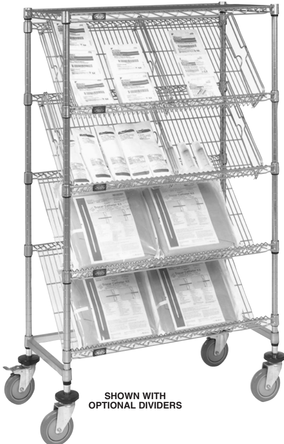
SHOWN WITH OPTIONAL DIVIDERS